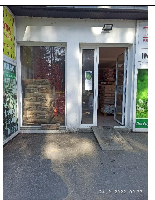
Notification on socio-economic survey and map of project area – Municipality of Berane