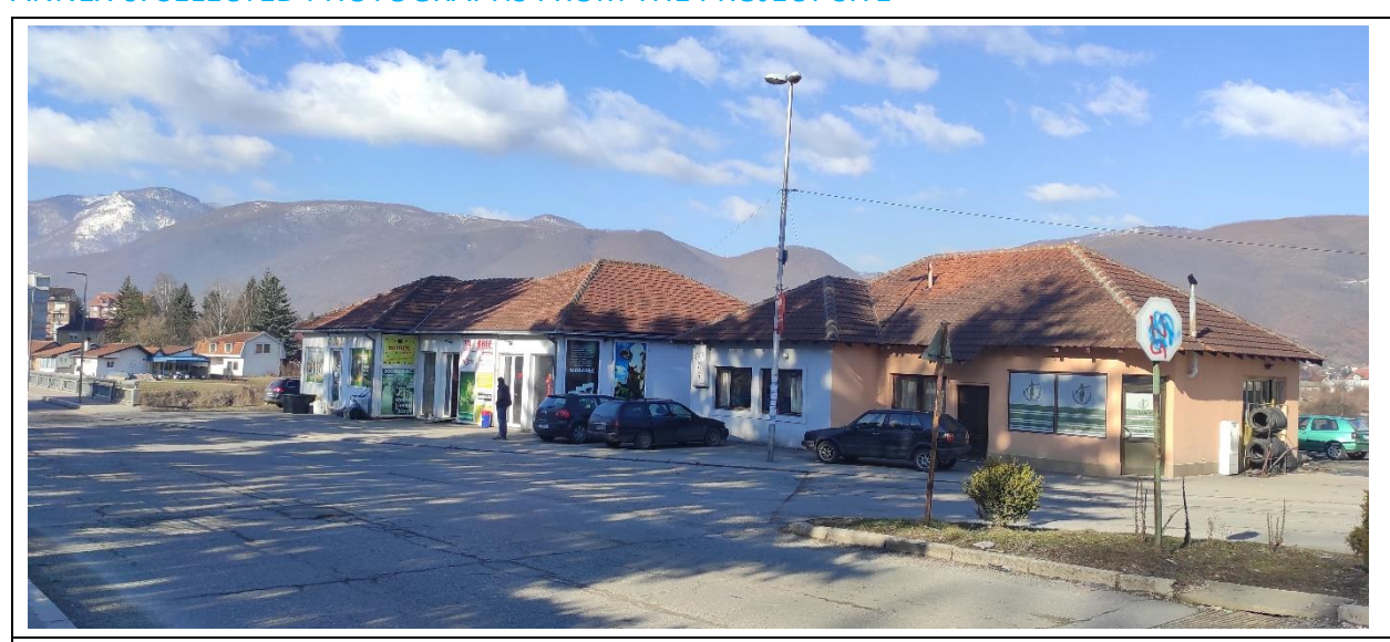
Location of 4 surveyed businesses