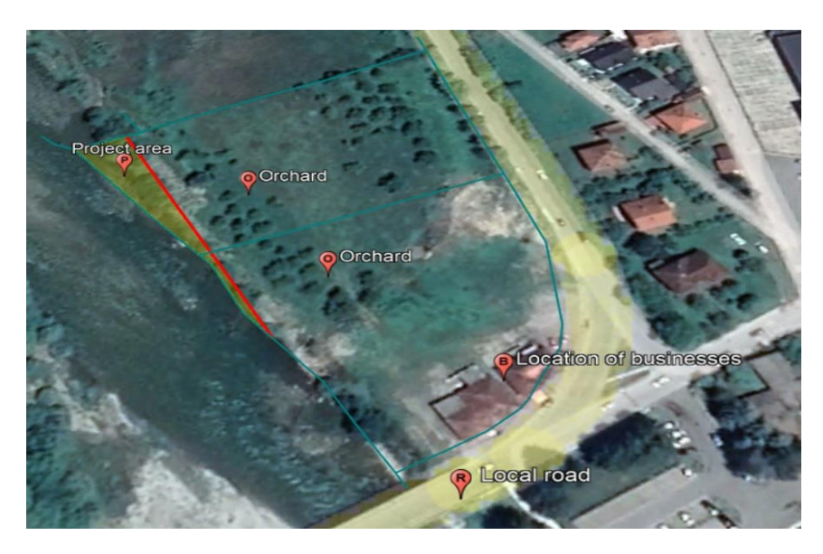
Figure 1 – Distance between the sub-project area, the four businesses and orchards

No state-owned land plots are affected by the sub-project. The sub-project also does not include state-owned land plots that are ceded to natural or legal persons.