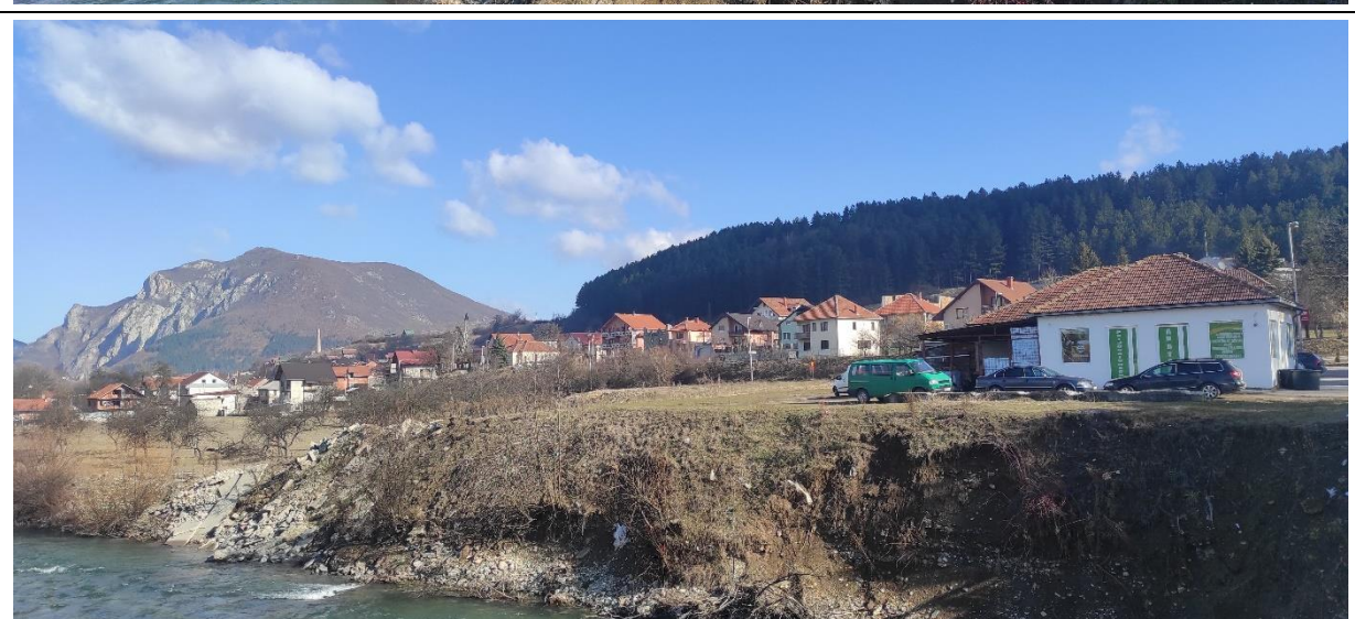
Location of project area