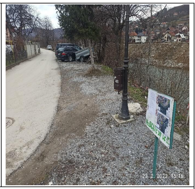
Notification on socio-economic survey and map of project area – Municipality of Bijelo Polje