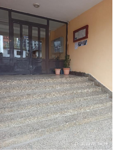
Notification on socio-economic survey and map of project area – Municipality of Bijelo Polje